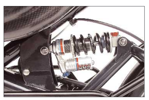
Suspension element ST8ARC with adjustable damping and piggyback gas tank.

As an upgrade option a rear suspension element with separately adjustable compression and rebound damping is available. In addition to this the suspension element has a bigger gas volume in the damper that leads to better suspension performance due to lower pressure and thus less stiction of the piston.